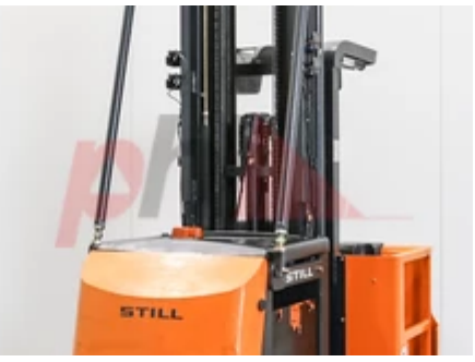
PHL (UK) Limited., For Lane, Basingstoke, RG25 2RP, United Kingdom